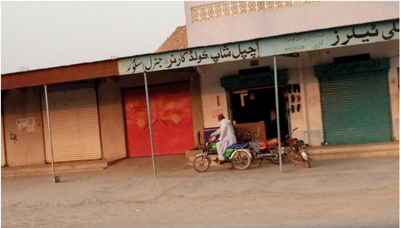
Closed shops and an almost deserted street in Larkana, Sindh, Pakistan, September 2021.