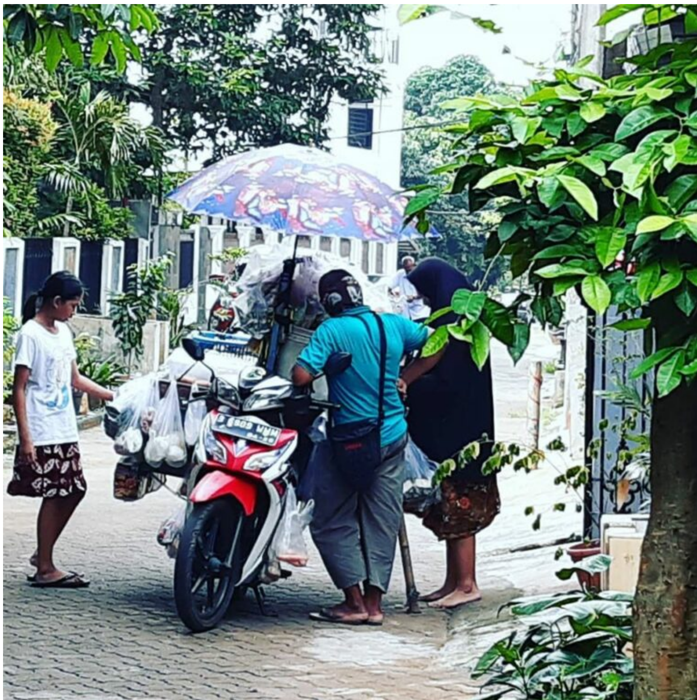
A mobile vegetable vendor delivering orders for food, stationery, and other household essentials in Jakarta.